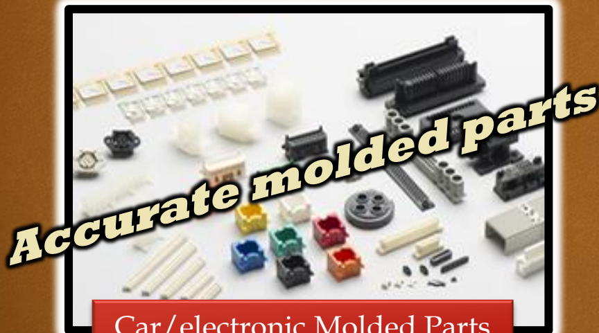
Car/electronic Molded Parts